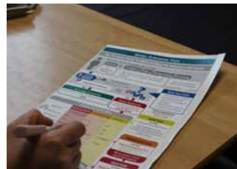
Pictured: Sepsis Screening Tool

2.00pm: Around this time we head down to the departments to assess the patients we earlier identified as being admitted or treated for sepsis. We use this time to look at the patients' notes and discuss with the patients their care and their diagnosis. We have patient information leaflets that we provide for them to read to help them understand a little more about their condition and to give reassurance. We also use this time to promote good practice and use of the sepsis pathway and sepsis screening tool with staff.